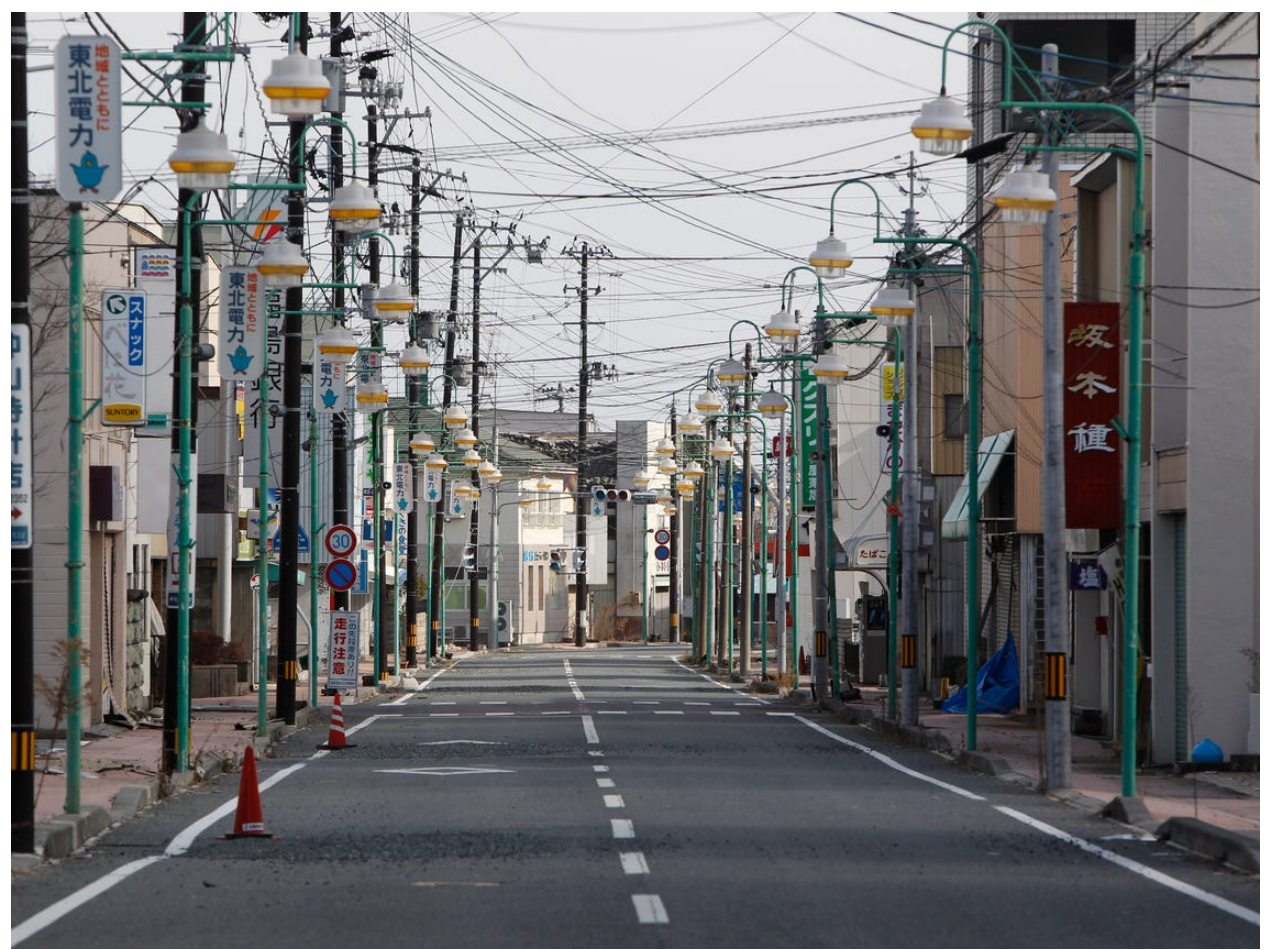
Fukushima Today: Nuclear Ghost Town in Japan