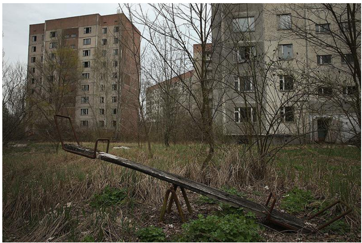
Chernobyl Ghost Town today