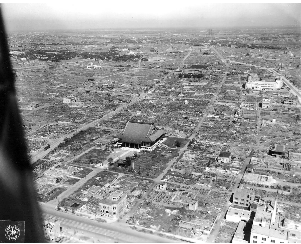
Massive damage from firebombing of Tokyo