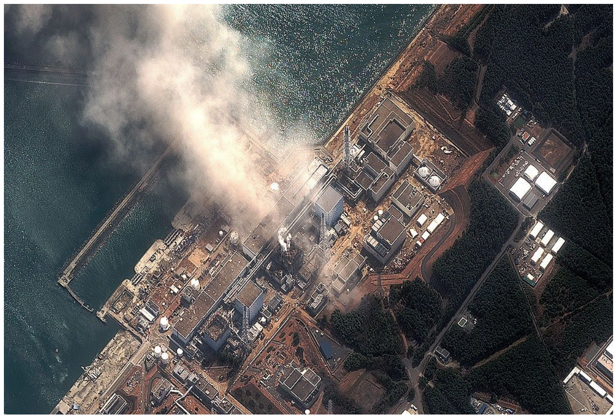
2011 Fukushima Disaster

Japan's government announced a decision to begin dumping more than a million tons of treated but still radioactive wastewater from the crippled Fukushima nuclear plant into the Pacific Ocean in two years.